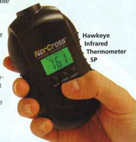
Hawkeye Infrared Thermometer SP

area of the riser that's failing. If there are no variations and the risers and manifolds seem to be just fine, check out the intake, thermostat and raw-water impeller to be sure you're getting plenty of flow in the first place. Considering your description, a problem with the riser is most likely. LR