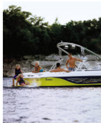
A boatload of passengers will want to chill, which makes the transom design so useful.