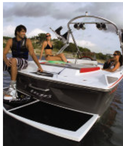
Cuts and sharp lines in the hull and deck are traits that took years to perfect.

In all, the boat delivers versatile performance, one of the widest interior lounges and bows on the market, and a very fresh design. We say the overall package of the RZ2 was worth all the R&D.